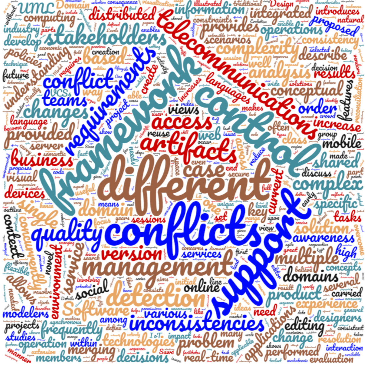
Figure 1: Emerging Concepts in Abstracts from Articles Published 2012 to 2017.